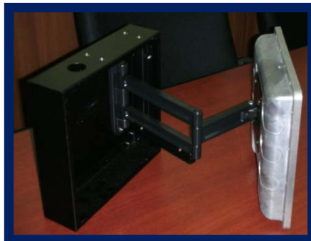
Construction Enclosure w/ Arm