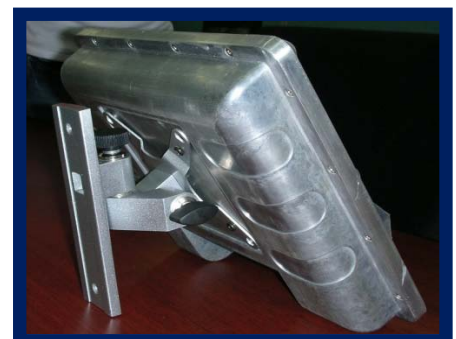
Waterproof Desktop Mount