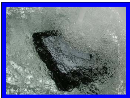
Underwater IP67 Test