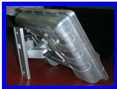
Waterproof Wall Mount