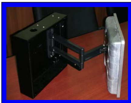
Construction Enclosure with arm