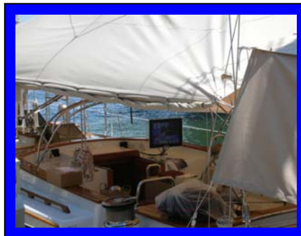
On a 90' Sailing Boat, Captain's Chair