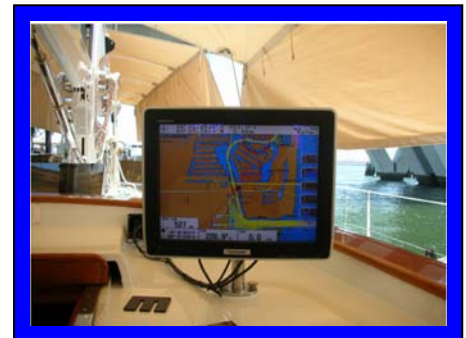
Connected to Navigation System On a Sailing Boat