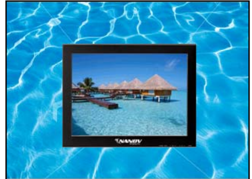
20.1" Waterproof Outdoor LCD TV Front Picture