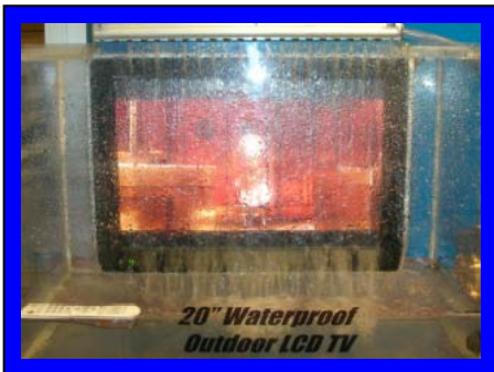
Underwater Test at Miami Boat Show