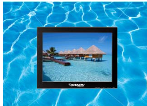
20.1" Waterproof Outdoor LCD TV Front Picture