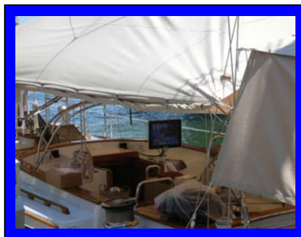
On a 90' Sailing Boat, Captain's Chair