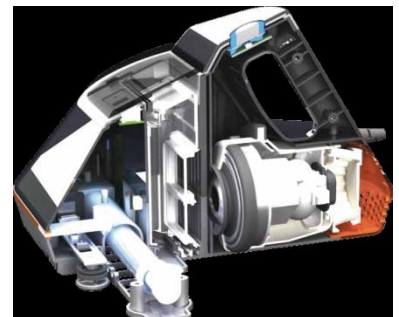
3600 times/minute vibration pad