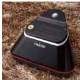
Safety sensor and easy design