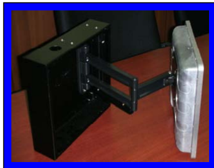
Construction Enclosure with arm