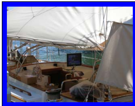
On a 90' Sailing Boat, Captain's Chair