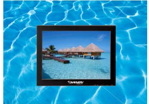
20.1" Waterproof Outdoor LCD TV Front Picture