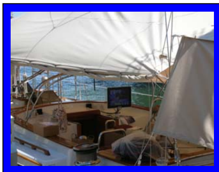
On a 90' Sailing Boat, Captain's Chair