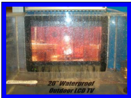
Underwater Test at Miami Boat Show