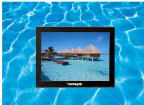
20.1" Waterproof Outdoor LCD TV Front Picture