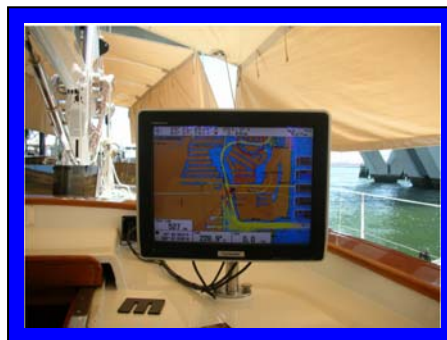
Connected to Navigation System On a Sailing Boat