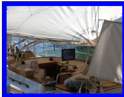
On a 90' Sailing Boat, Captain's Chair