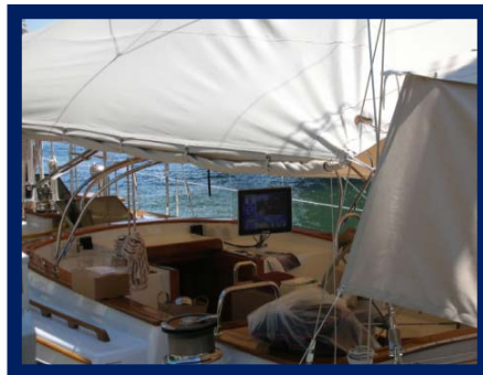
Sailboat Captain's Chair