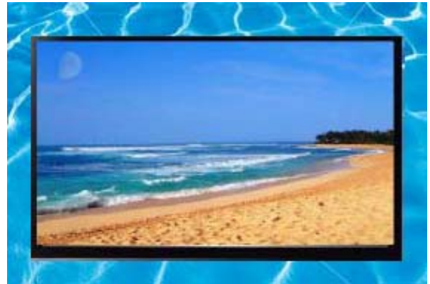
32" Waterproof Outdoor LCD TV Front Picture