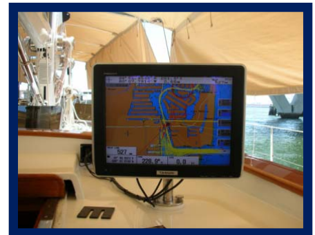
Sailboat Navigation System