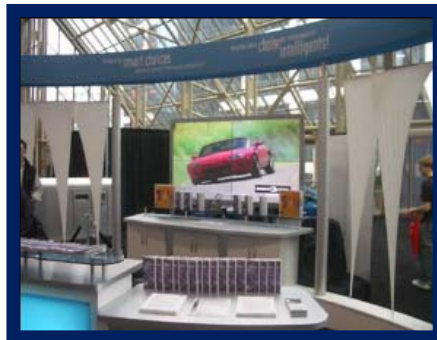
70" Outdoor LCD TV/Monitor