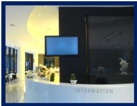
Professional Digital Signage